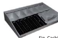
Fig. Cashier equipment Inkiess 880PL

Cashier equipment consists of coin trays, coin and note boxes, full details upon request.