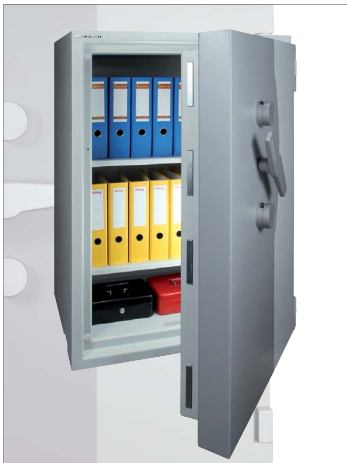
Fig. Safe DWS1200KB, hinge right 2 x N-Lock La Gard 3390VZ (3 wheels), 2 shelves